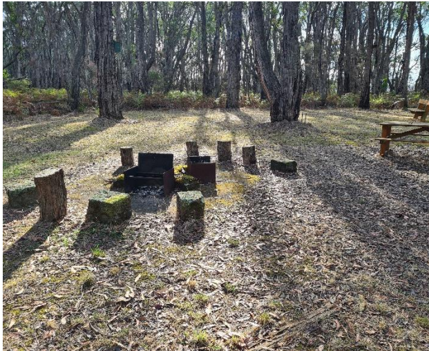
Things were also looking a bit brown at the BBQ area....