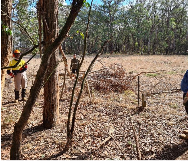
Clearing a fallen branch on our north boundary at the Board's working bee (26 April).